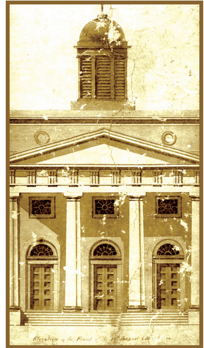
THE FIRST BAPTIST CHURCH charleston, south carolina